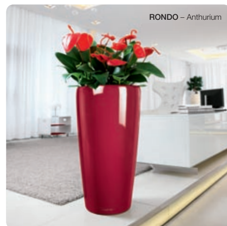
RONDO – Anthurium