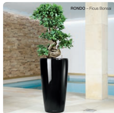
RONDO – Ficus Bonsai