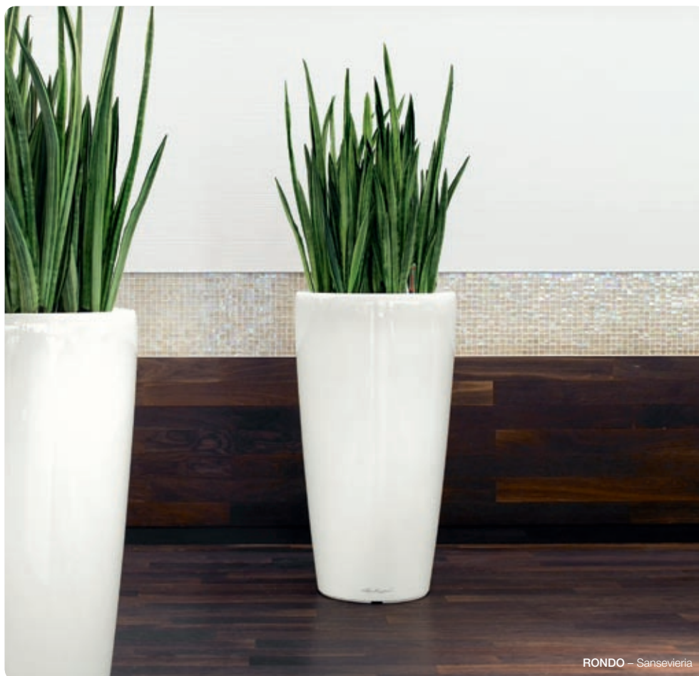
RONDO – Sansevieria